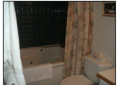
Bedroom side of Condo ("A")