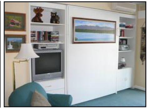
Studio side of Condo ("B")